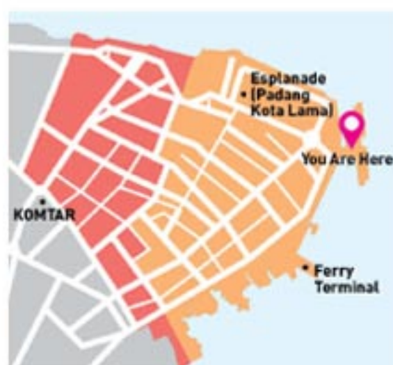
Map of George Town UNESCO World Heritage Site

For centuries, George Town has been the port of call for ships from all over the world. Today, the sense that overwhelms every traveller here is no different from when the founder Captain Francis Light and his first settlers made land here in 1786 - the desire to explore, discover and indulge.